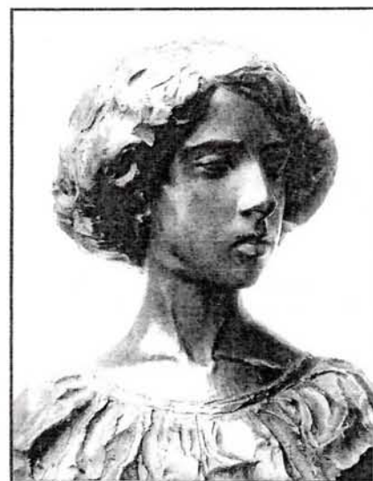
D'Annunzio's Daughter, 1903. bronze, Krakow National Museum